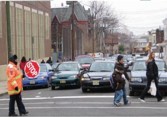
Parents picking up their children from Roberto Clemente School in Newark at the end of the day create high traffic volumes and pedestrian constraints.