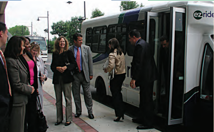
Commuters at Secaucus Junction typify those who choose shuttles for convenience and savings.